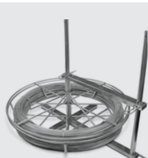
Three Way Wire Spinner