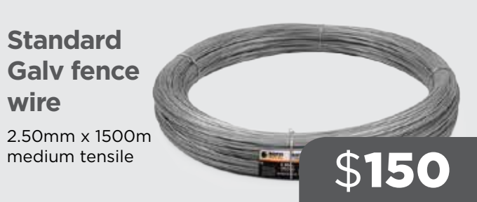
Standard Galv fence wire