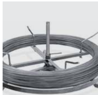
Standard Wire Spinner