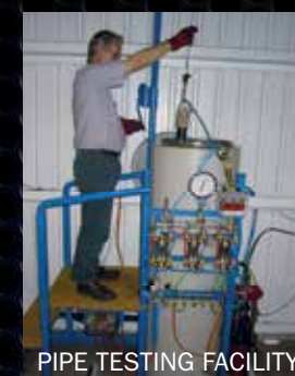
PIPE TESTING FACILITY

Goldline GRB polypipe is QC tested to 850 kPa Pressure rating at 20 degrees for 50 year design life. It is also covered by our warranty and field service policies.