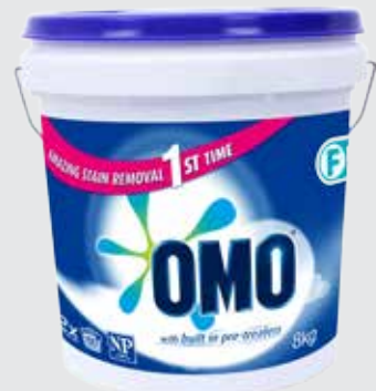
OMO TOP LOAD LAUNDRY POWDER 8KG BUCKET 21008345