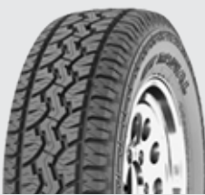
31X10.5R15LT GT*Advance 109S OWL