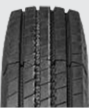
11R22.5 16PR Tornado GL282A 146/143M