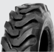
16.9x28 12PR TL Amour R-4 LOM R-4; LOM