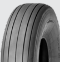
9.5L-1SSL 12 PR TL Alliance 542 I-1; Implement