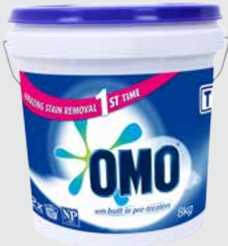
OMO FRONT LOAD LAUNDRY POWDER 8KG BUCKET 21008346