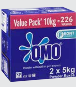
OMO TOP LOAD LAUNDRY POWDER 10KG BOX 20281378