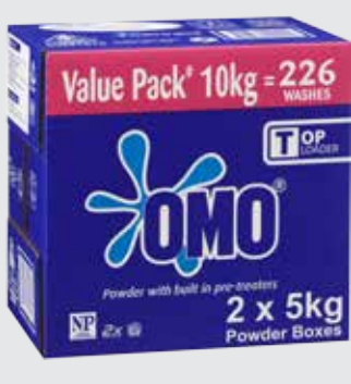
OMO FRONT LOAD LAUNDRY POWDER 10KG BOX 20281379