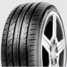
235/45R17 Sunfull SF-886 XL P7W